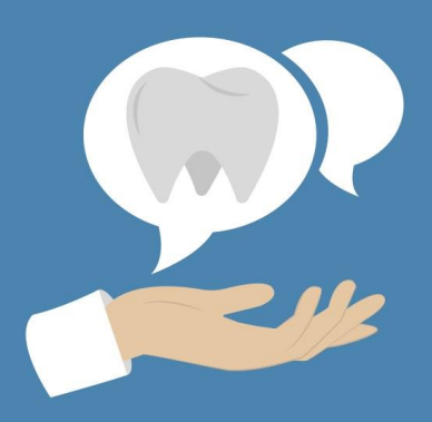
All of your feedback is important to us