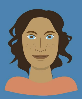
We want to make it easy for you to raise a concern or complain, if you need to